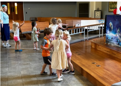
Scenes from VBS 2023