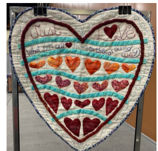
Quilt with "Just Love" theme—made for the quilt challenge