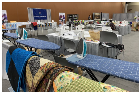
Working on quilts at Servant Center