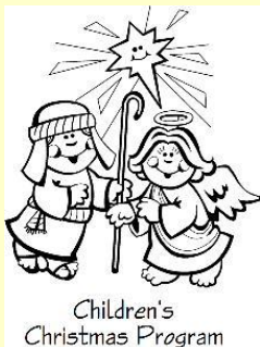
Children's Christmas Program